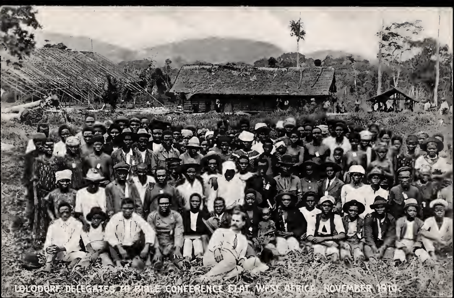
LOLODORF DELEGATES TO BIBLE CONFERENCE ELAT, WEST AFRICA, NOVEMBER 1910.